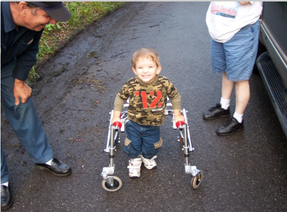
One of our young residents; given the gift of a handicap ramp at his home by one of our summer work groups.

The Highland Educational Project (HEP), located in McDowell County, is an ecumenical outreach ministry of the Episcopal Diocese of West Virginia. Started as an educational ministry in January 1940, HEP has since evolved into an outreach agency due to the deteriorating economic conditions and increasing poverty in the area.