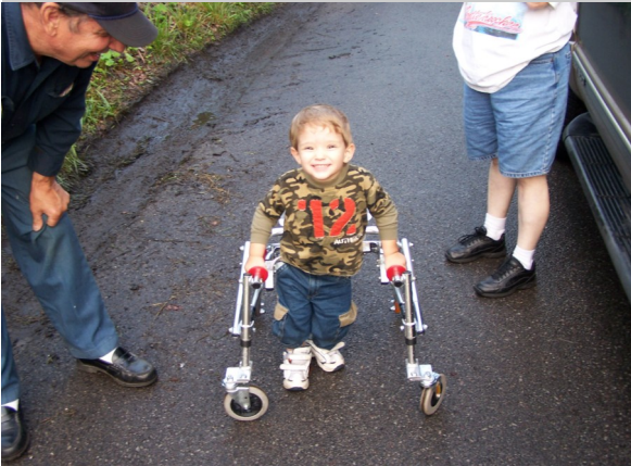
One of our young residents; given the gift of a handicap ramp at his home by one of our summer work groups.

The Highland Educational Project (HEP), located in McDowell County, is an ecumenical outreach ministry of the Episcopal Diocese of West Virginia. Started as an educational ministry in January 1940, HEP has since evolved into an outreach agency due to the deteriorating economic conditions and increasing poverty in the area.